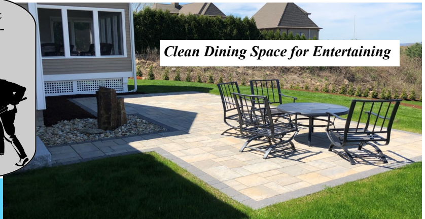
Clean Dining Space for Entertaining

Outdoor Patios Areas: Many homeowners are putting a lot of thought & planning into their home additions these days. There are many options available.