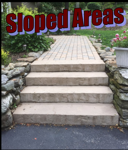
New or replacement concrete stairs and stepping stones for sloped areas