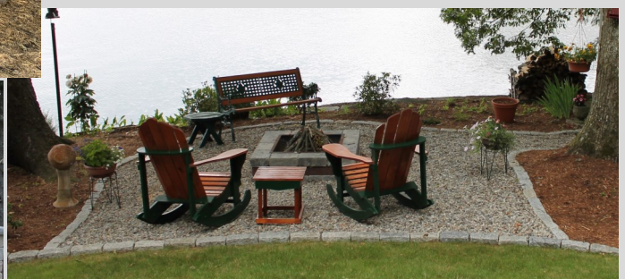
Above is a more informal area to relax and enjoy. Created with cobbles edging, crushed stone and mulch.