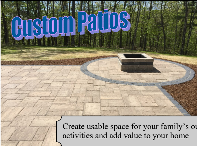
Create usable space for your family's outdoor activities and add value to your home