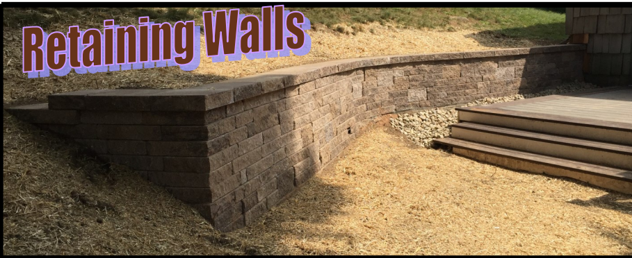
Concrete Walls offer grading and retaining solutions with style and durability