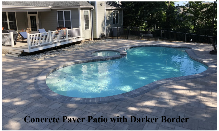
Concrete Paver Patio with Darker Border