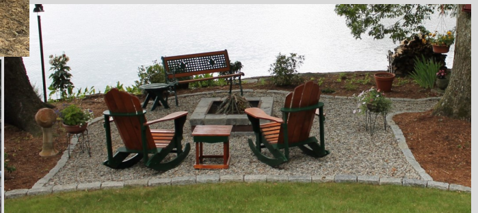
Above is a more informal area to relax and enjoy. Created with cobblestone edging, crushed stone and mulch.