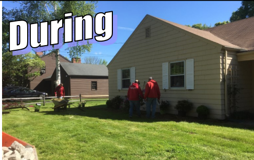
Lower Maintenance Designed Plantings...

Update your mature and overgrown landscape by removing unwanted plants and adding some color and interest with low maintenance trees, shrubs and perennials.