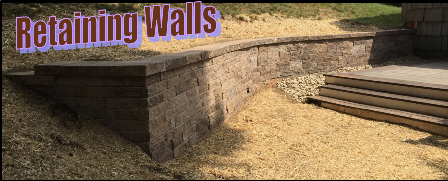
Concrete Walls offer grading and retaining solutions with style and durability