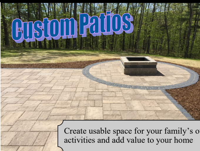
Create usable space for your family's outdoor activities and add value to your home