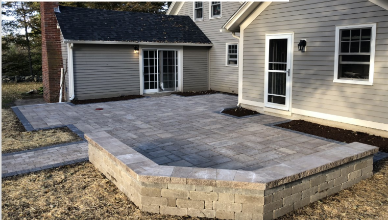
Customize a backyard living area for cleaner usable space and your lifestyle...

One of today's hottest trends in outdoor entertaining is incorporating fireplaces, outdoor fire pits, and grills or chimneys in your backyard so you can enjoy a cozy fire during spring, summer, and fall. For decades homeowners out West and down South, have extending their quality time outdoors with family and friends by installing heating elements that are functional as well as enjoyable. Instead of the pool or Jacuzzi that doesn't quite get used as often when company comes over, they create an area with benches and chairs with an inviting fire to gather around safely. Enjoy a delicious meal outdoors and then have a place to converse or to enjoy romanti-