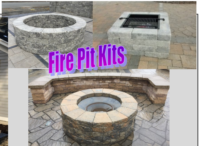
Fire Pit Kits