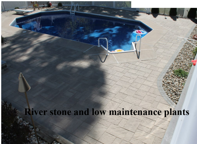
River stone and low maintenance plants