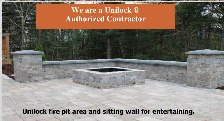
Unilock fire pit area and sitting wall for entertaining.