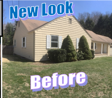
Add curb appeal with color and textures including cobblestone edging with either our premium mulch or some riverstone

July-September are great times to plant: beautiful plant and tree selection for summer color available this time of year!