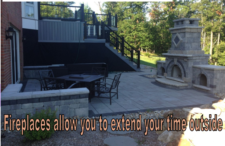
Fireplaces allow you to extend your time outside

Outdoor Living Rooms: Many homeowners are putting a lot of thought & planning into their home additions these days. Create an open outdoor living area with a view of your backyard for the warmer seasons by installing an open gazebo/canopy on a patio with side curtains for privacy & protection from the elements and insects. You can even create different areas on a paver patio for relaxing with a good book, grilling, enjoying a fire, children's area with picnic table, entertaining with friends around a bar...the ideas are endless. Let us show you how to create an outdoor patio designed for your lifestyle and specific needs. Below are some additional items that can add to your enjoyment when spending time on your paver patio with your loved ones and friends.