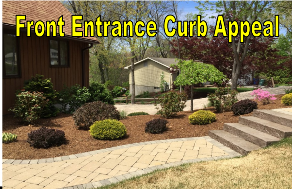
Front Entrance Curb Appeal