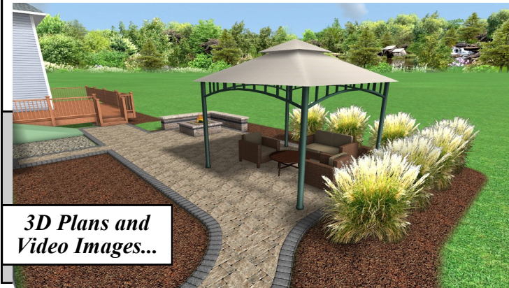
3D Plans and Video Images...