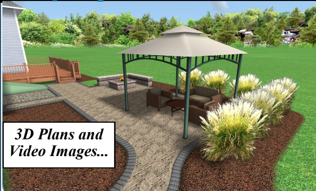
3D Plans and Video Images...

Having problems visualizing your new landscape project? One of the biggest problems some homeowners face with landscape design is trying to visualize the final project. Most people just keep their fingers crossed and hope it will turn out well. At Picture Perfect Landscape that is not good enough. The highly detailed pictures and walkthrough functions of our 3D design program will show you what your new project will look like when finished. We can add details like different furniture, trees, shade structures, etc. with a click of the mouse to help find solutions for your particular situation. We want to make it easy for you to see our ideas for your property and to fine tune them & make them your own BEFORE we start building. This service is offered during the slower winter and early spring months to allow us to concentrate on the time and details needed to create these drawn to scale computer 3D renderings. This way our clients are ready to go as soon as the weather warms up for planting and the nurseries have the best selection